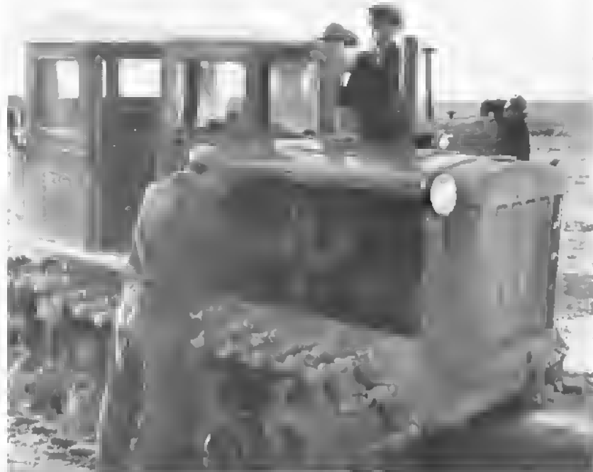
Inspecting and tuning up tractors in preparation for turning over new farmland.

Tsetung Thought. She asks others to help her and consistently puts what she learns into practice. Although old enough to rest now, she insists on herding and refuses to be idle. If anyone suggests that she retire, she replies, "I act according to Chairman Mao's instructions. If I live one more day, I will serve the people one more day."